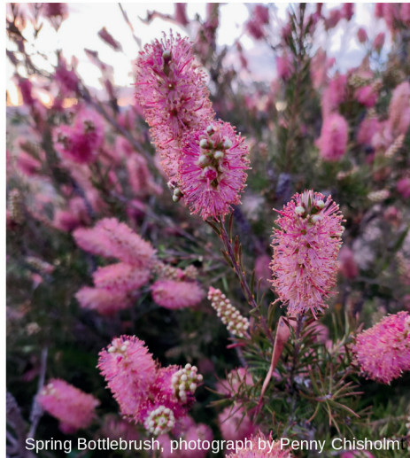
Spring Bottlebrush, photograph by Penny Chisholm