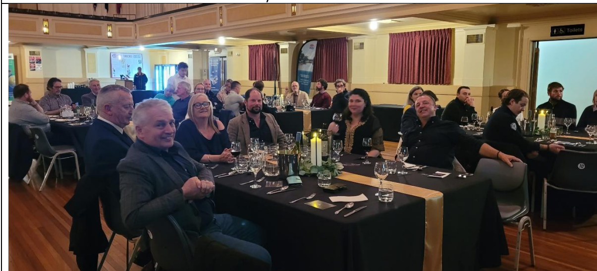
IMG 0004 – 2024 National Conference Gala Dinner