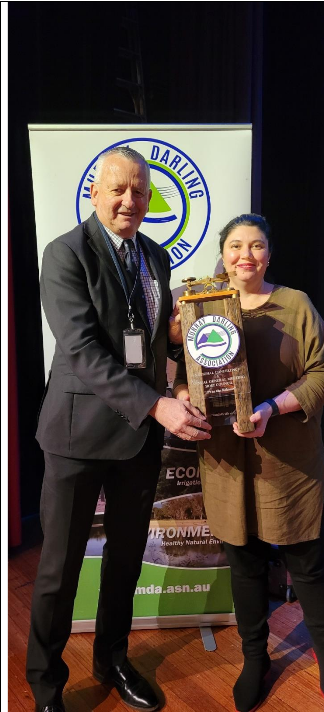
IMG 0002 – 2025 National Conference Host announced; Griffith City Council.