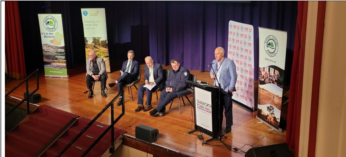
IMG 0001 – 2024 National Conference; Guest Speakers engaging with delegates