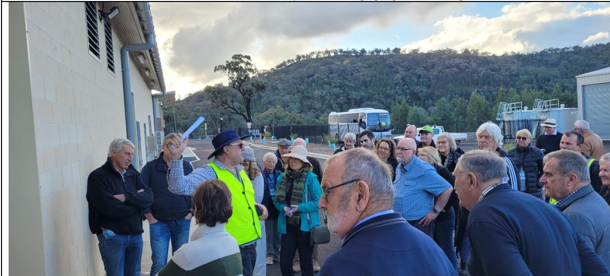
IMG 0003 – 2024 National Conference Study Tour