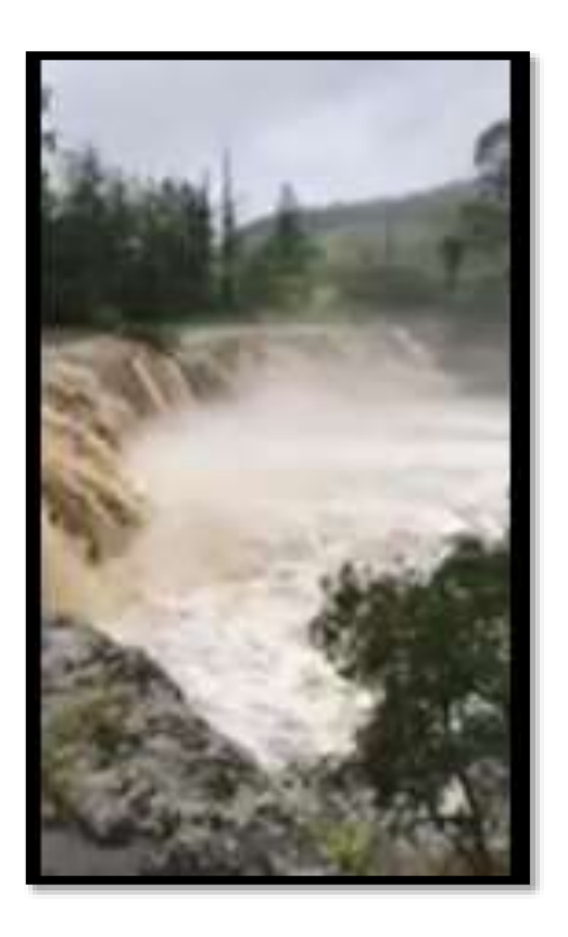
Figures 1 and 2: Water flowing in the Tooloom Creek and over the Tooloom Falls and Weir April 2021 & March 2022

Good rains in April meant that the weir continues to overflow from January to November 2021 and December to April 2022. As a result, we have seen an increase in water quality.