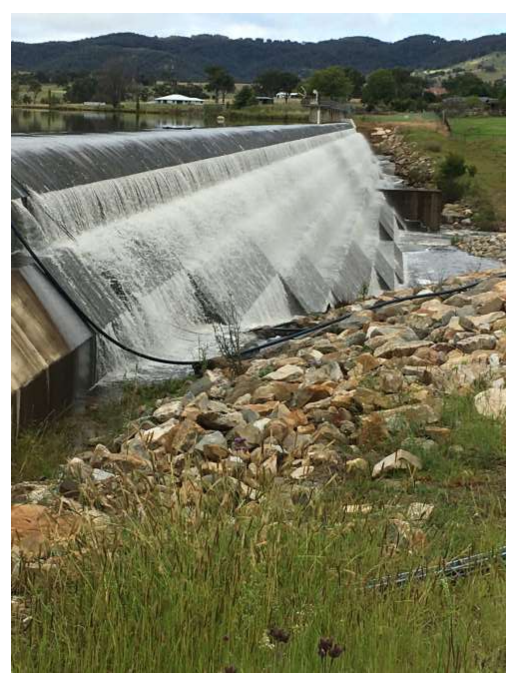
Figure 1: View of Dam Wall March 2022

Good rains and continued rainfall in January to with flooding in October and November 2021 continuing into July 2022 that have seen the dam continue to overtop. As a result, we have seen a decrease in water quality and made the need for pumping water from the bores to be put on hold. The RO plant has been reactivated to continue the testing regime, as laboratories have now opened as COVID-19 still impacts operations.