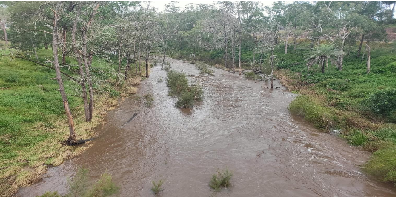
Figures 1 and 2: Water flowing in the Tooloom Creek and over the Tooloom Falls and Weir April 2021

Good rains in February meant that the weir overflowed for the first time since December 2017 and continued rainfall in July, August and December 2020 including January to November 2021. As a result we have seen an increase in water quality.